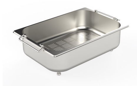
CUVETTE PERFOREE INOX A154 F00 * only in combination with the accessory A644 F04