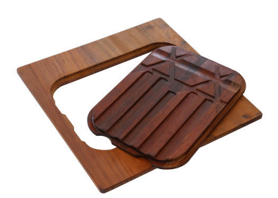
PLANCHE DE DECOUPE DOUBLE IROKO A644 F04